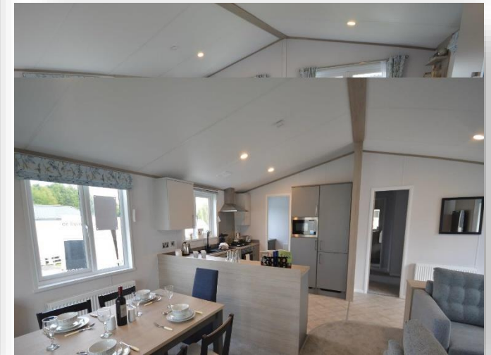
Atlas Wisteria Lodge Weeks Lane, Dawlish Warren Dawlish EX7 0LZ