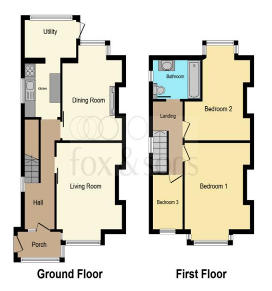
This floor plan is for illustrative purposes only. It is not drawn to scale. Any measurements, floor areas (including any total floor area), openings and orientation are approximate. No details are guaranteed, they cannot be relied upon for any purpose and they do not form part of any agreement. No liability is taken for any error, omission or misstatement. A party must rely upon its own inspection(s). Powered by www fooabaent com