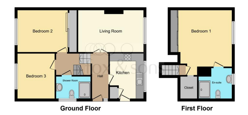
This floor plan is for illustrative purposes only. It is not drawn to scale. Any measurements, floor areas (including any total floor area), openings and orientation are approximate. No details are guaranteed, they cannot be relied upon for any purpose and they do not form part of any agreement. No liability is taken for any error, omission or misstatement. A party must rely upon its own inspection(s). Powered by www.focalaagencom.com