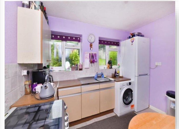
Henacre Road, Kingsbridge TQ7 1DN