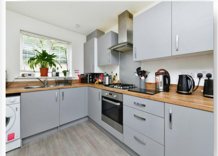
Sunnydale Close, Ivybridge PL21 9FZ