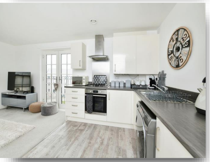
Flat 9 Capricorn Way, Sherford Plymouth PL9 8GH