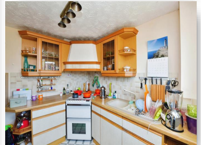
Yealmpstone Close, Plymouth PL7 1XL