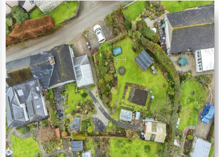
Hillside, Venton, Plymouth PL7 5DR