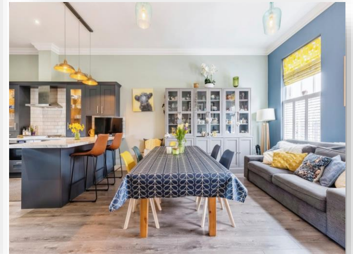
Orion Drive, Sherford Plymouth PL9 8GL