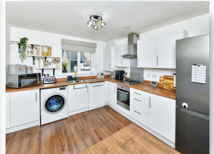
Sunnydale Close, Ivybridge PL21 9FZ