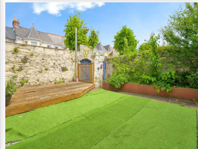
Devon Terrace, Plymouth PL3 4JD