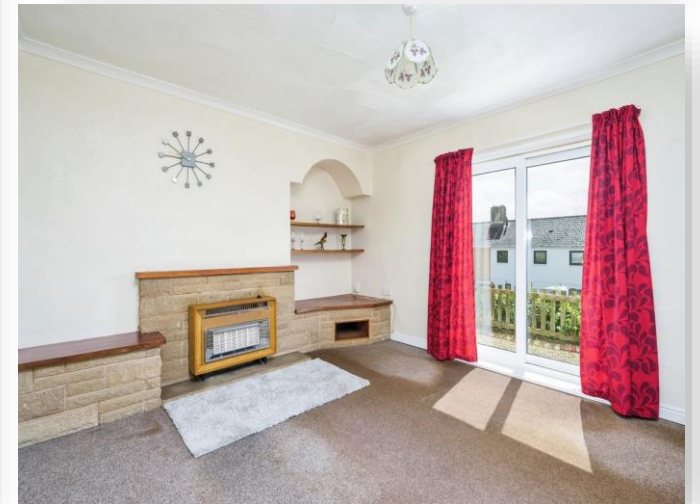
Mirador Place, Plymouth PL4 9HE