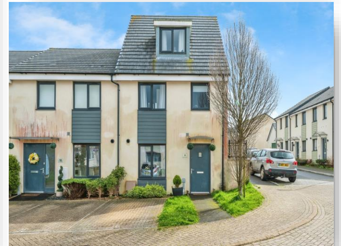
Bethany Gardens, Pennycross, Plymouth PL2 3FG