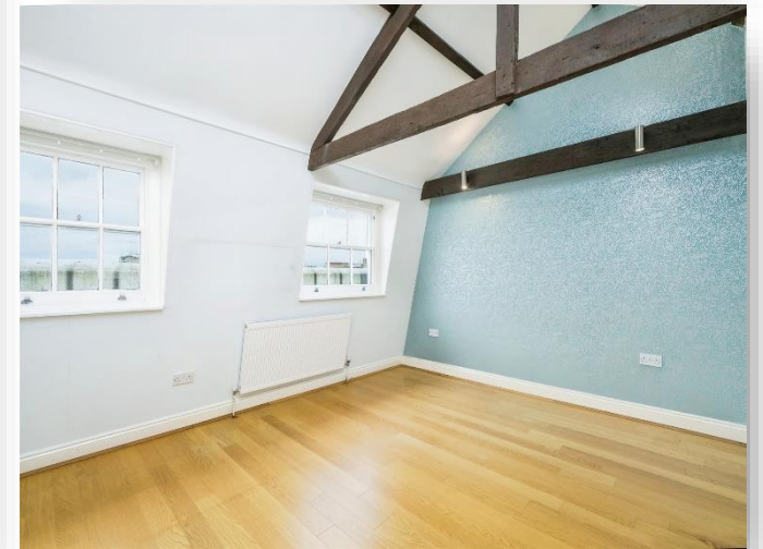
Flat 4 The Esplanade, The Hoe, Plymouth PL1 2PJ