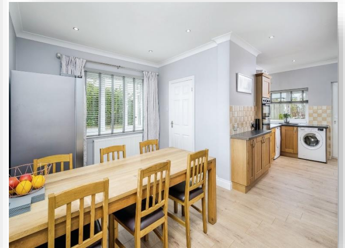
Ashford Crescent, Mannamead, Plymouth PL3 5AB