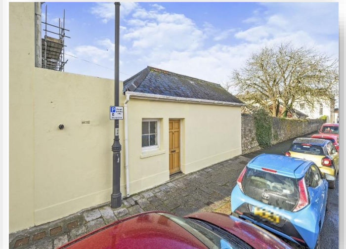
Caroline Place, Millbay, Plymouth PL1 3PS