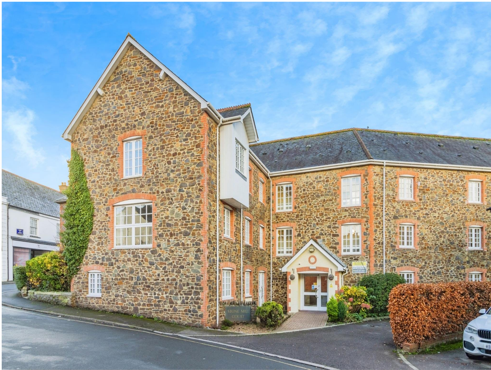
Stone Mill Court, Park Terrace, Minehead, TA24 5NE