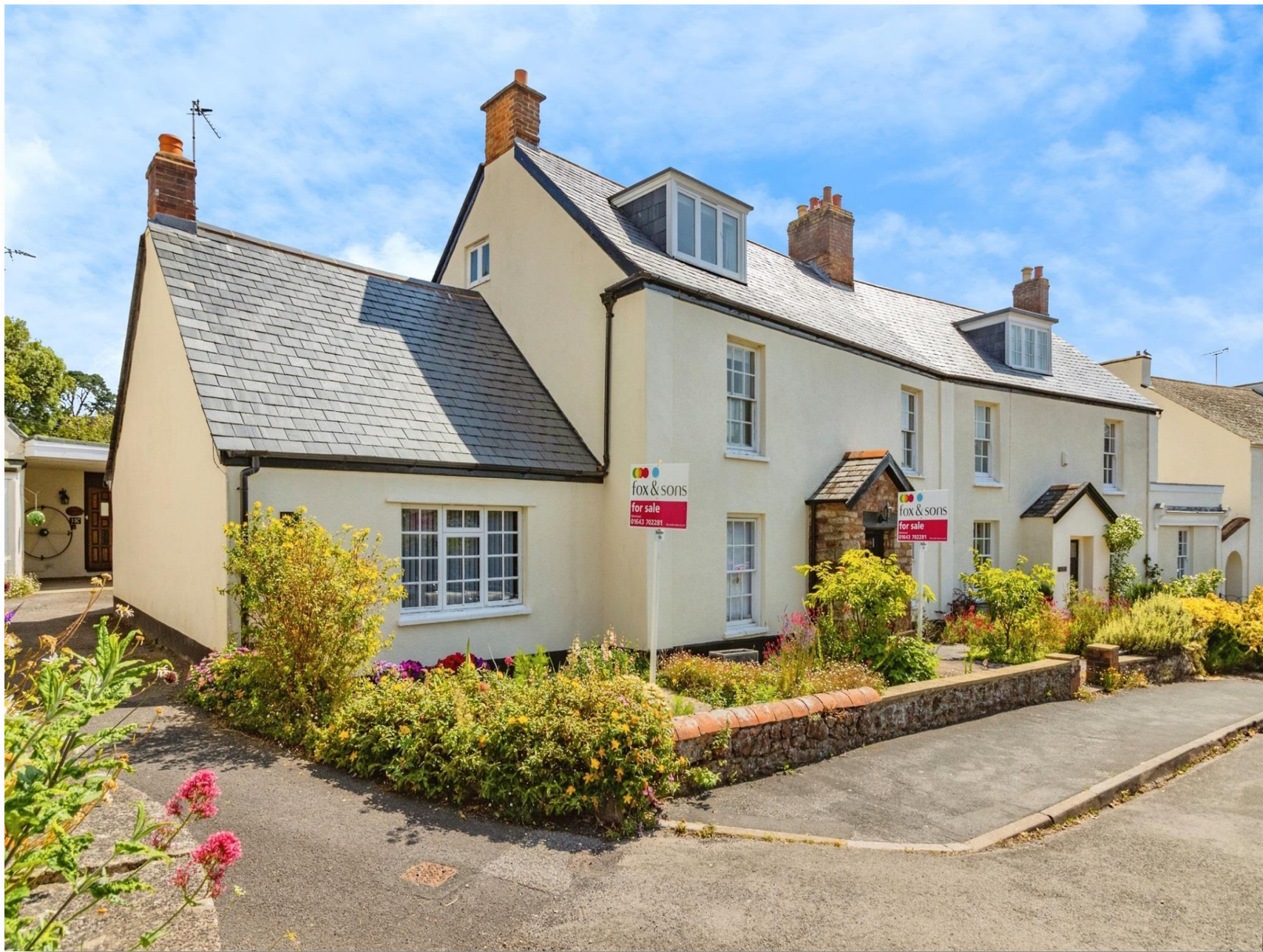
The Parks, Minehead, TA24 8BS