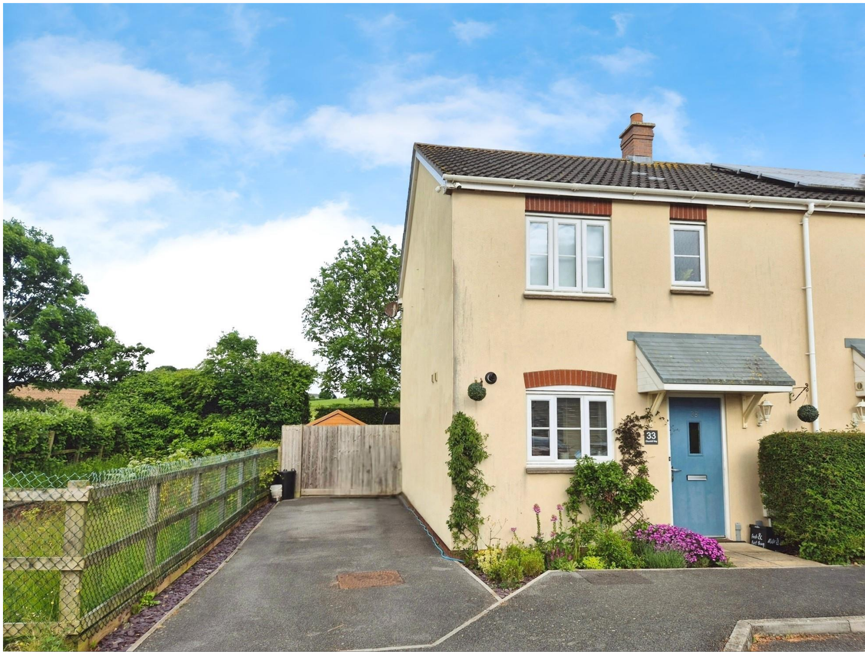
Churchill Way, WATCHET, TA23 0JQ