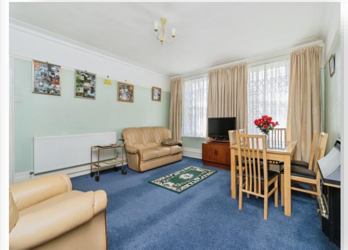
The Parks, Minehead, TA24 8BS