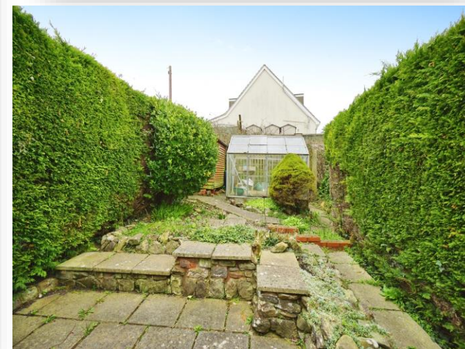
Severn Terrace, Watchet, TA23 0AS