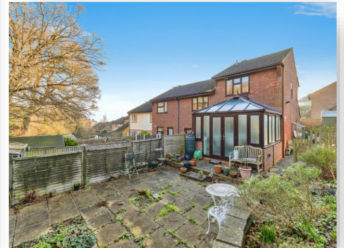
Parklands Rise, Minehead, TA24 8UD