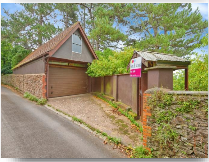
The Racks, Beacon Road, Minehead TA24 5SE