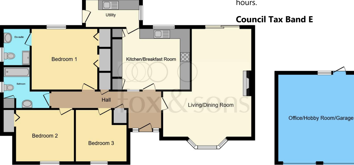
check out more properties at fox-and-sons.co.uk

The property is situated within the pretty coastal resort of Minehead, known as the gateway to Exmoor and the start of The South West Coast Path. Minehead offers a good range of day to day amenities, a hospital and schools for all ages including a sixth form college. The rolling hills of Exmoor, Quantock Hills and Brendon Hills are all within easy motoring distance as are the sandy beaches at Blue Anchor. The county town of Taunton is some 24 miles to the south and offers a further range of high street shops, public and state schools and great access links to both the M5 and A303. A direct train link to London Paddington is available from Taunton station in approximately two hours.