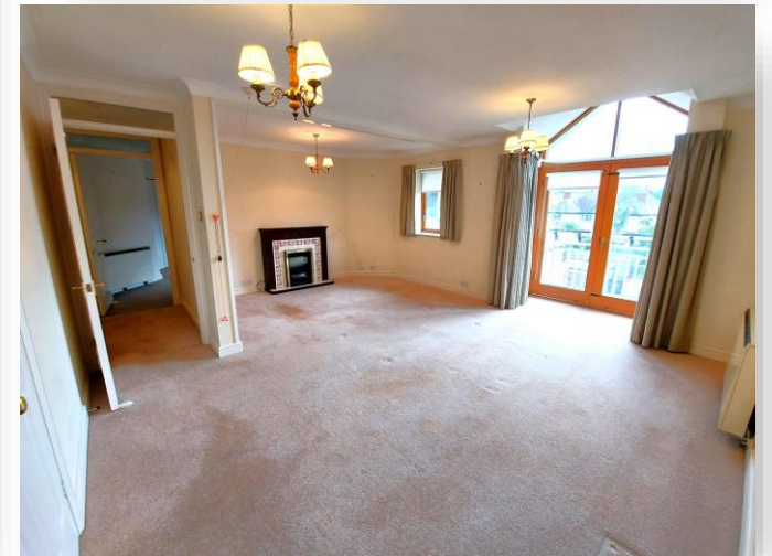
Peerage Court, Vennland Way, Minehead TA24 5DA