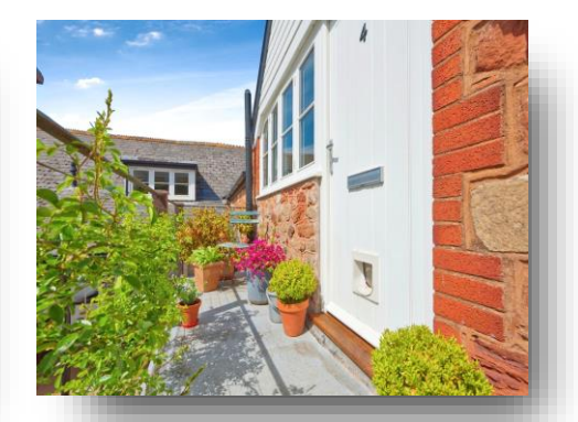
Old Clee