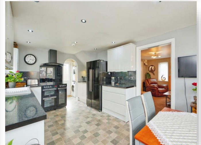
Hayfield Road, Minehead, TA24 6AD