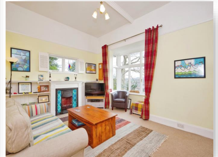
Clevelands, St. Michaels Road, Minehead TA24 5RZ