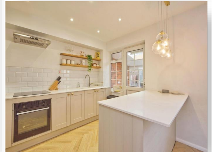
Whitegate Road, Minehead, TA24 5SS