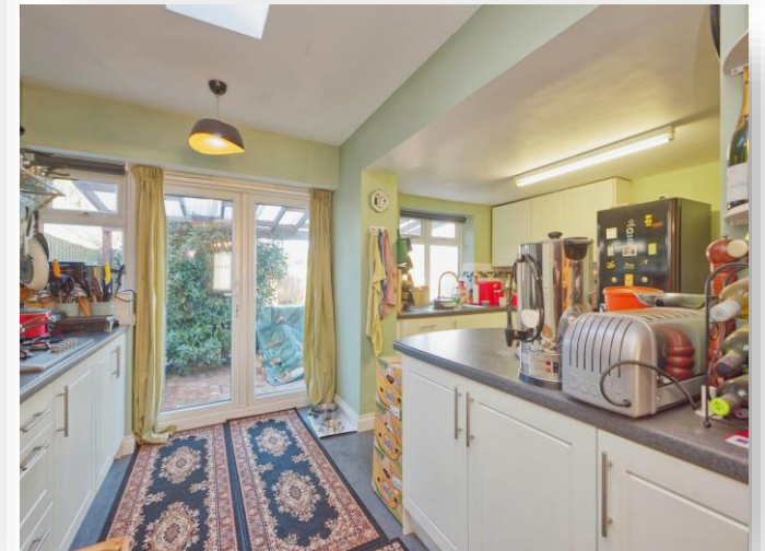
Elm Grove, Minehead TA24 6AA