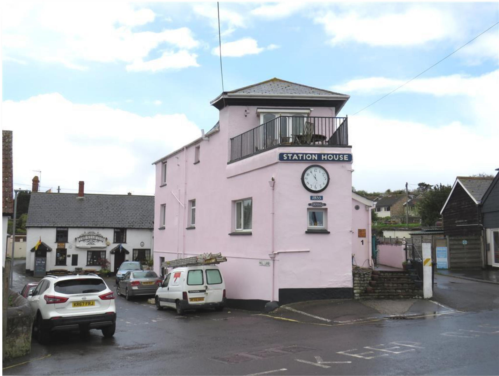
Flat 3, Station House, Market Street, Watchet TA23 0AW