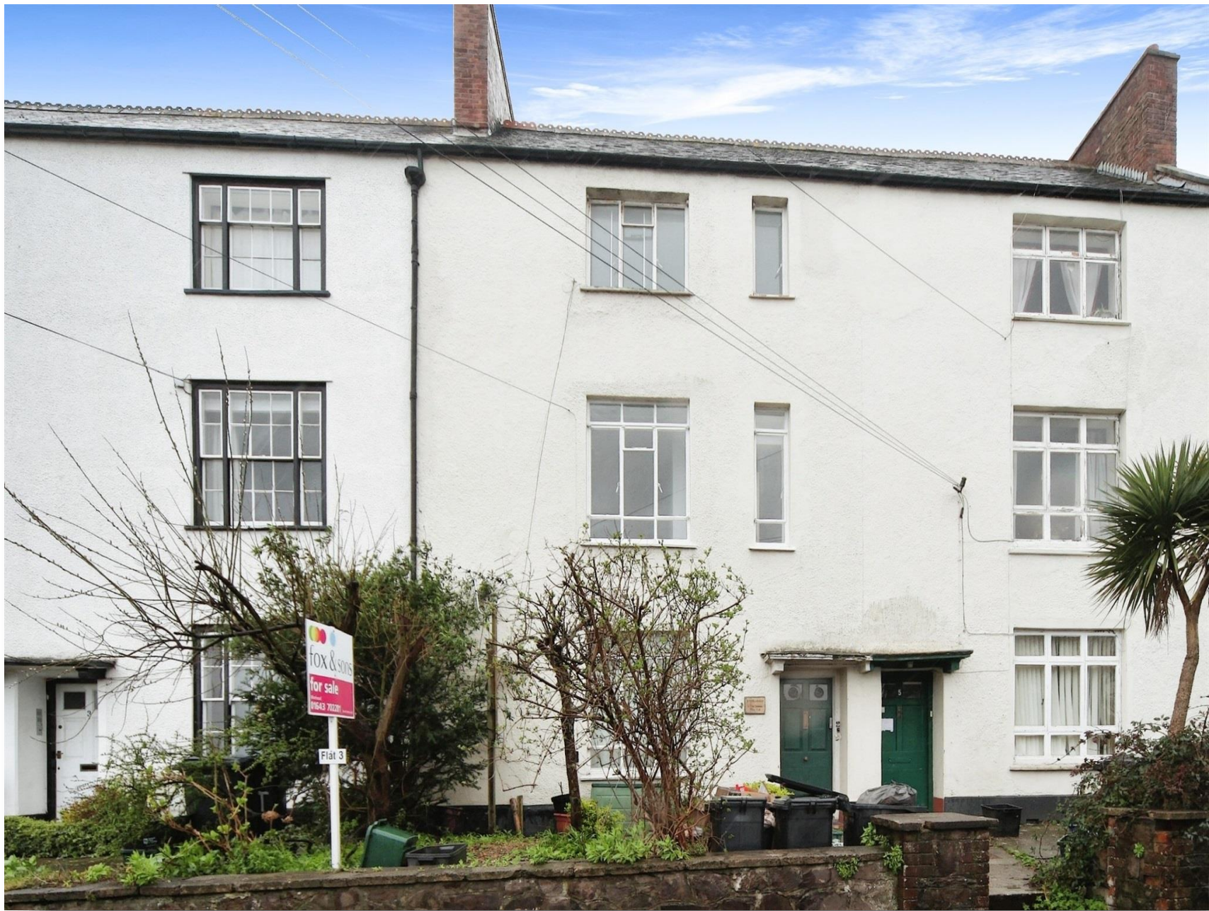
The Terrace, Minehead, TA24 6BG