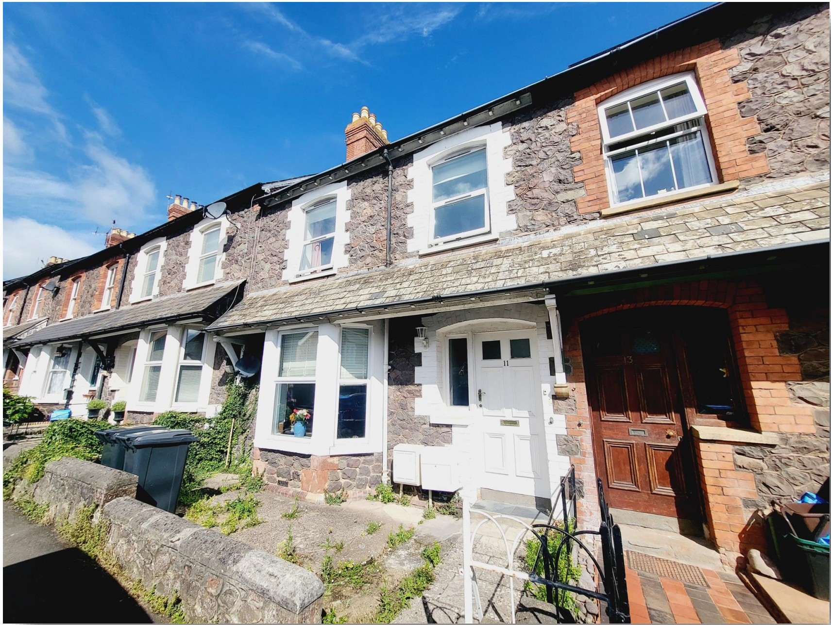
Selbourne Place, Minehead, TA24 5TY