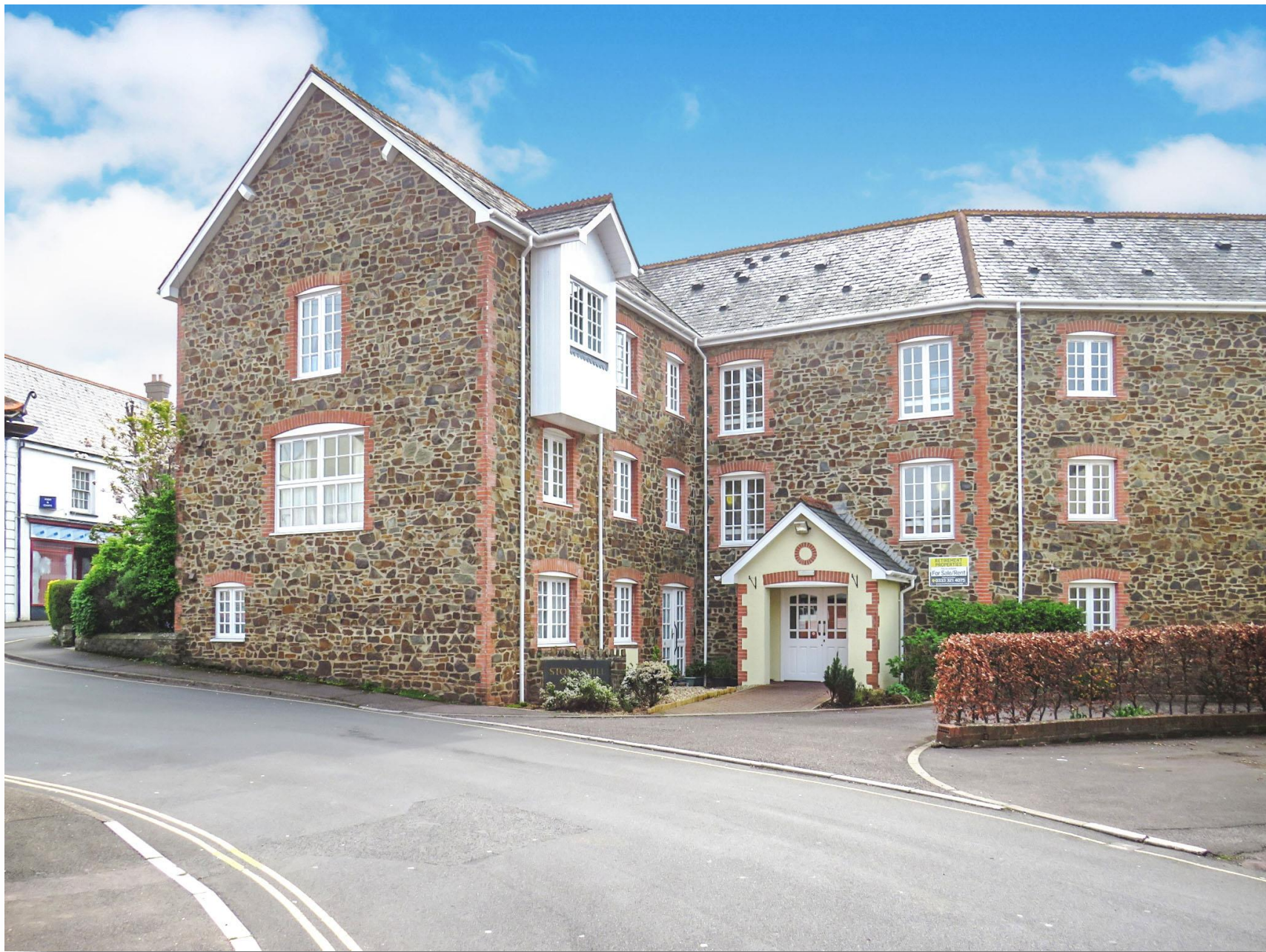
Stone Mill Court, Park Terrace, Minehead, TA24 5NE