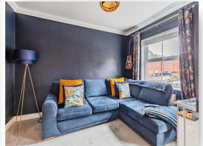
Batsmans Drive, Rushden NN10 6EW