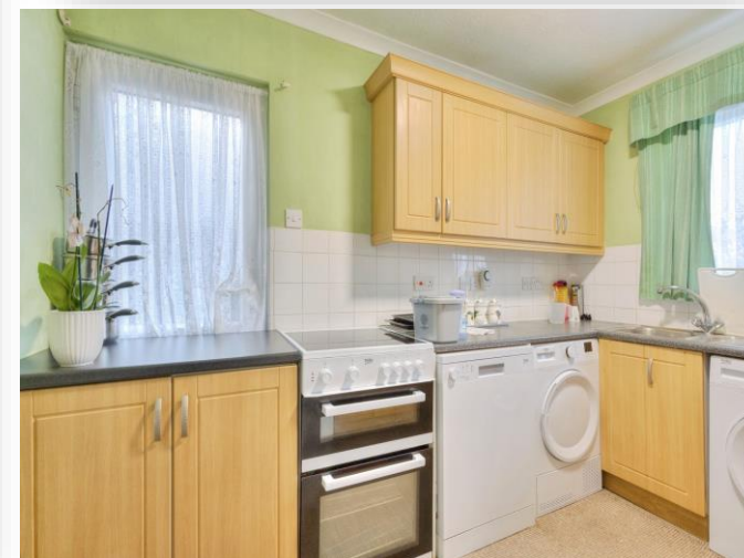
Barker Close, Rushden NN10 0EJ