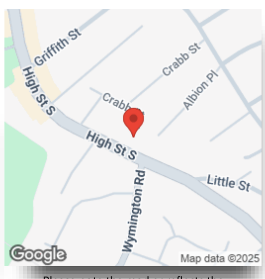
Please note the marker reflects the postcode not the actual property