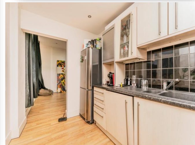
5 South Building Warmonds Hill, Higham Ferrers NN10 8PQ