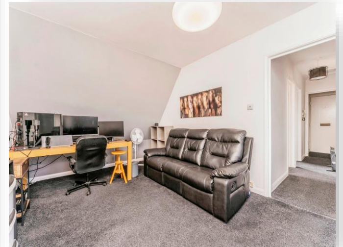
Gatcombe House Portland Road, Rushden NN10 0DE