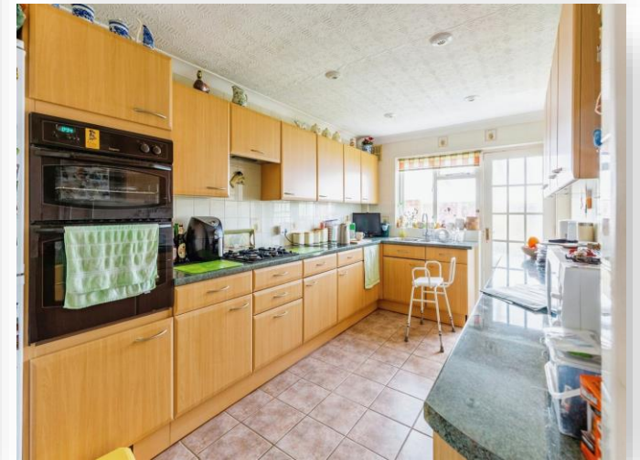
Woodland Road, Rushden NN10 6UT