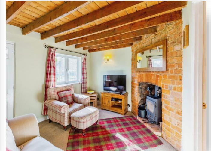
High Street, Souldrop Bedford MK44 1EY