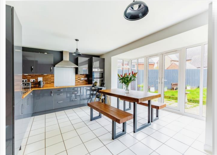
Heron Close, Higham Ferrers NN10 8LN