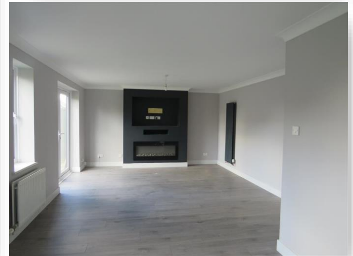
Fuchsia Way, Rushden NN10 0XF