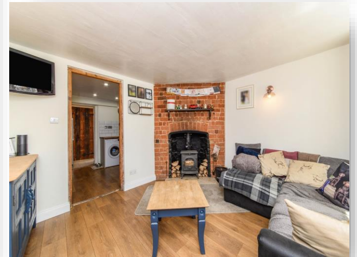
High Street, Souldrop Bedford MK44 1EY