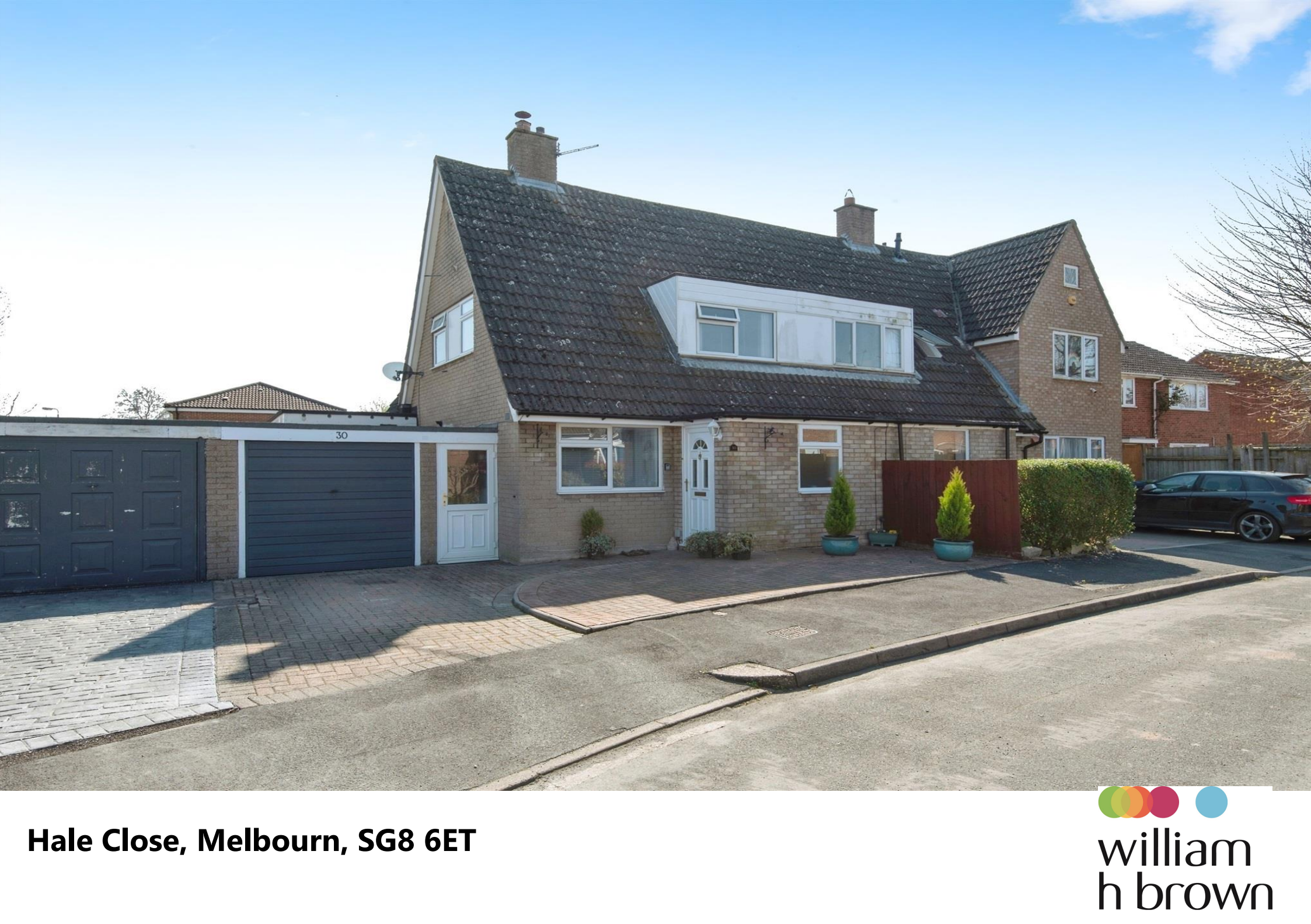
Hale Close, Melbourn, SG8 6ET