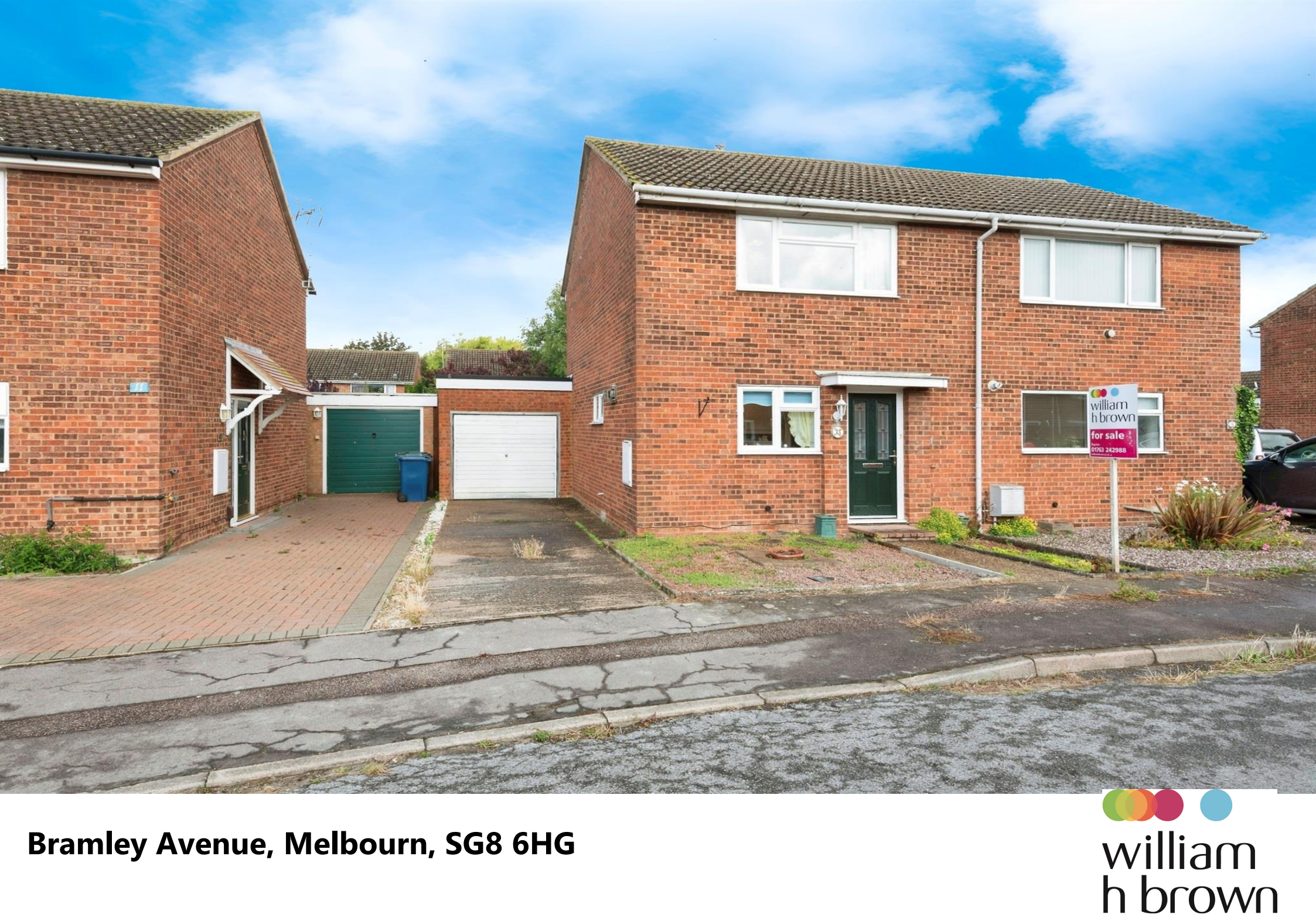
Bramley Avenue, Melbourn, SG8 6HG