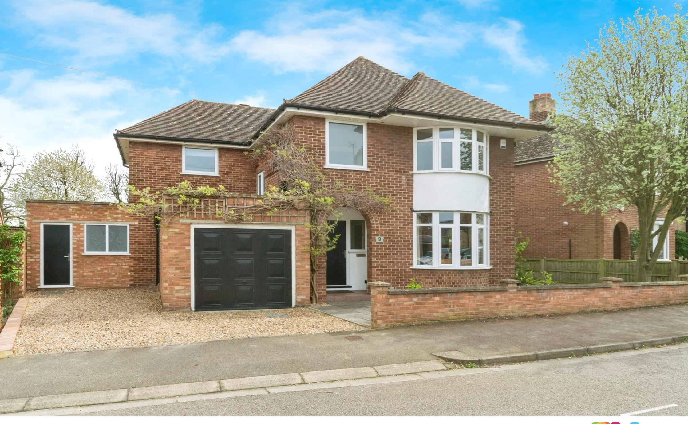
Victoria Crescent, Royston SG8 7AX