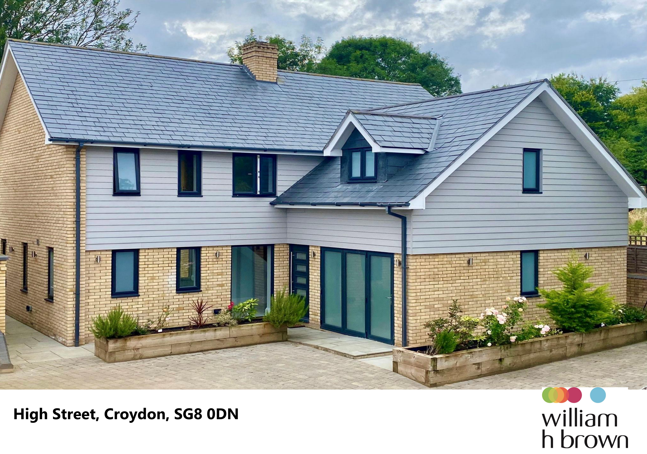
High Street, Croydon, SG8 0DN