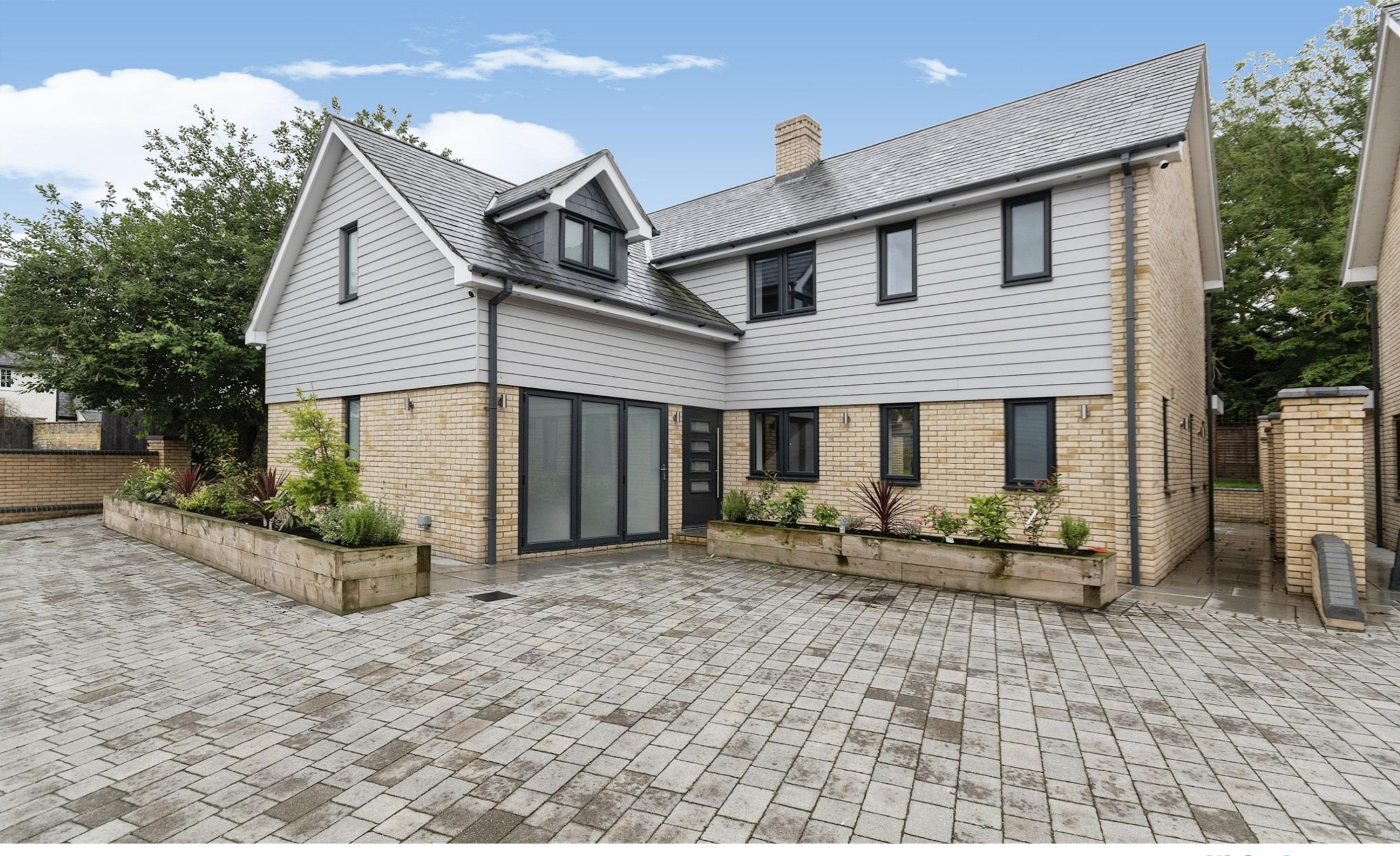
High Street, Croydon, Royston, SG8 0DN