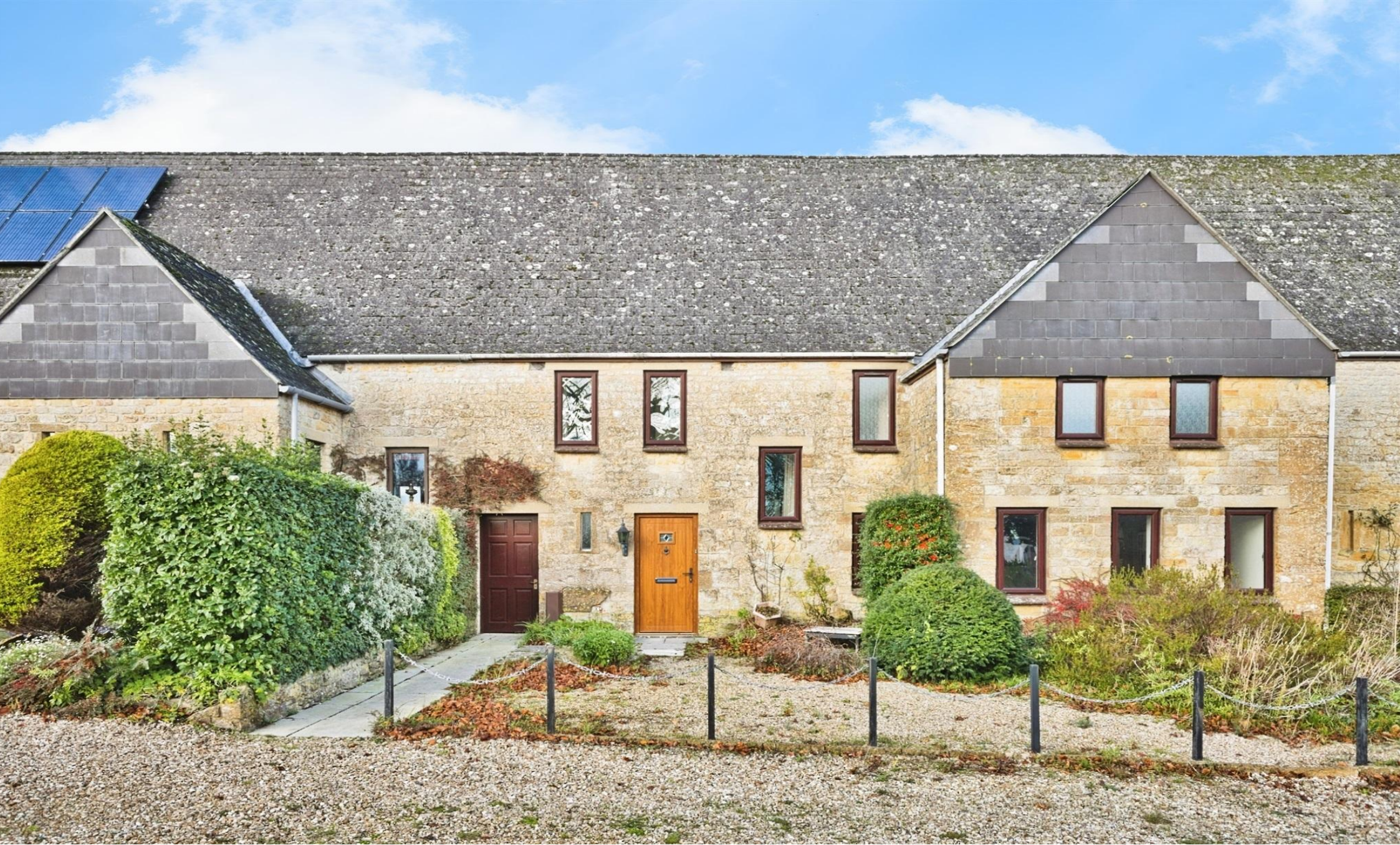
Tythe Barn, Barn Street, Crewkerne TA18 8BP